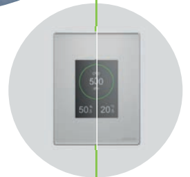
Occupiable rooms for aerobic exercise such as sports halls and gymnasiums.