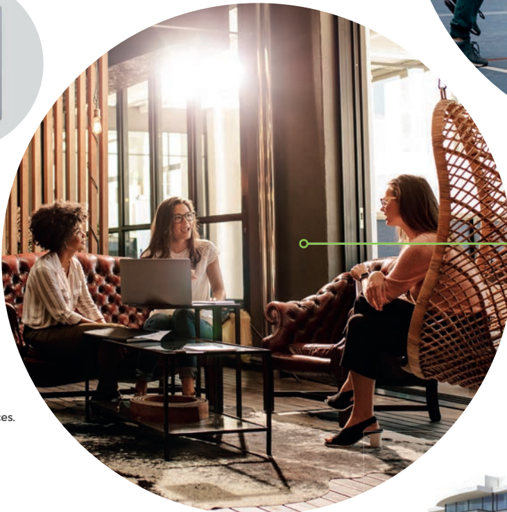
Occupiable rooms in offices.